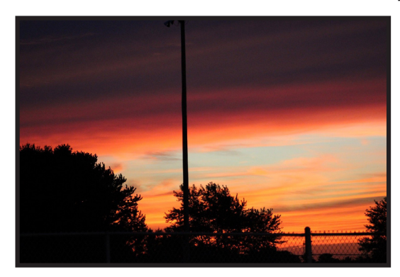
3rd -Grace Vogt